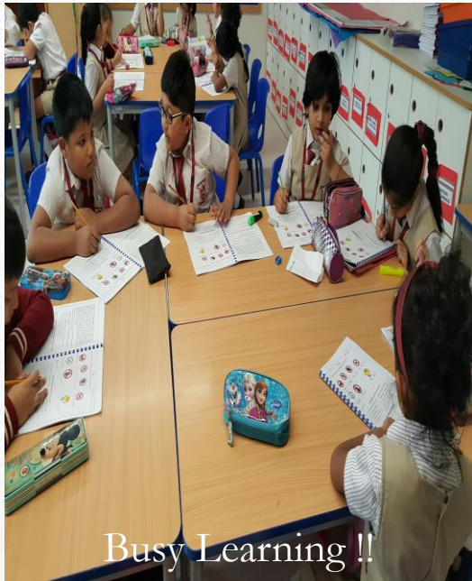
Busy Learning !!